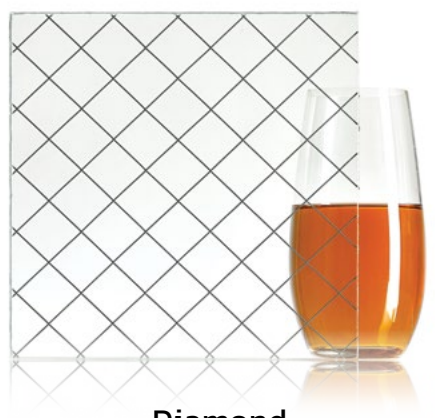
Diamond Diamond Polished Wire • 6mm in 78" x 100"

Wired glass is still used in some applications. It is offered in two distinctive patterns, diamond and squares.