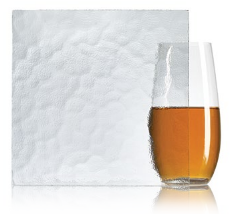
Aqualite Also known as Spraylite™ or Aquatex™ • 5mm in 72" x 96"

Pattern glass is timeless and provides some privacy while allowing light into the room. These classic patterns are now available from Walker Glass.