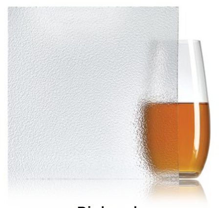
Pinhead Also known as Pinhead Morocco, Pattern 62, Pattern 516 or Stipolite

• 3mm in 72" x 84" • 3mm, 5mm, 6mm and 10mm in 72" x 96"