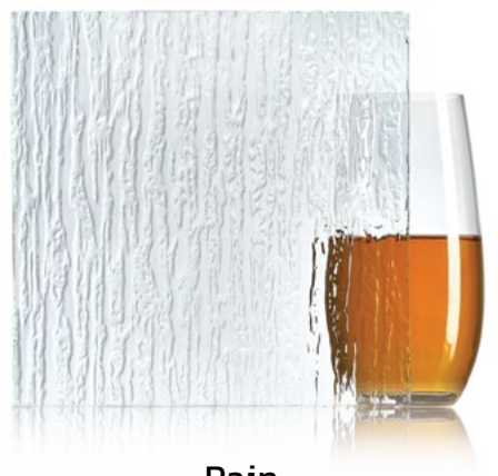
Rain Also known as Niagara

• 3mm in 72" x 84" • 3mm, 5mm, 6mm and 10mm in 72" x 96"