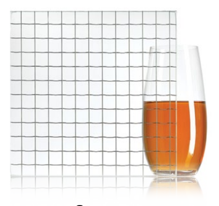
Squares Georgian Polished Wire ∙ 6mm in 78" x 100" and 78" x 130"

All wired glass are clear glass and comes in 4,000 lbs cases